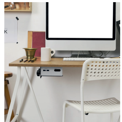
Can be fixed under desk