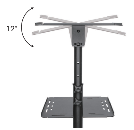
Upper shelf can be tilted 12° up and 12° down