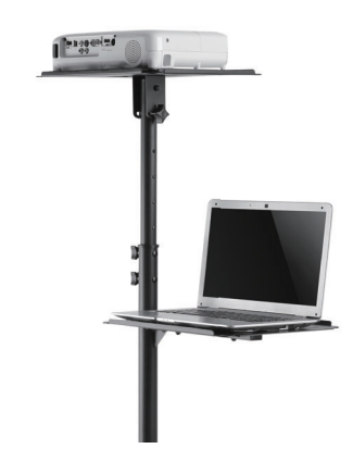
With a large surface to hold projector, laptop and more.