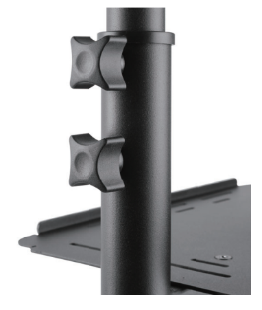
Stable height adjustment