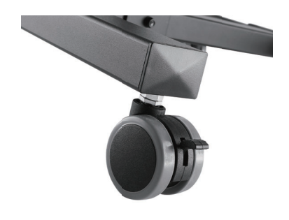
casters offer maximum stability (2 lockable)